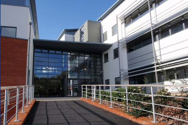
Innovation Centre, University of Exeter