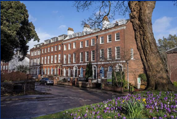
Southernhay East, Exeter

Swales & Willis Ltd Innovation Centre, Rennes Drive, University of Exeter, EX4 4RN, UK www.swaleswillis.co.uk